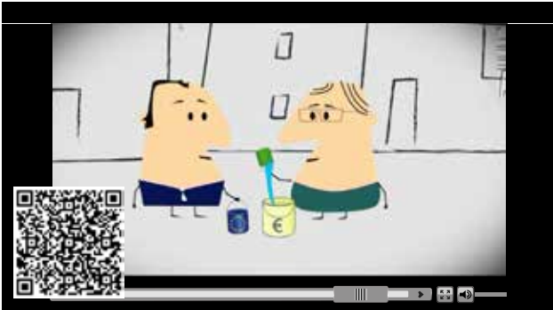
This short animated clip explains in simple terms the functioning and role of the European Social Fund.

environment in cooperation with the European Agency for Health and Safety at Work and the European Foundation for the Improvement of Living and Working Conditions.