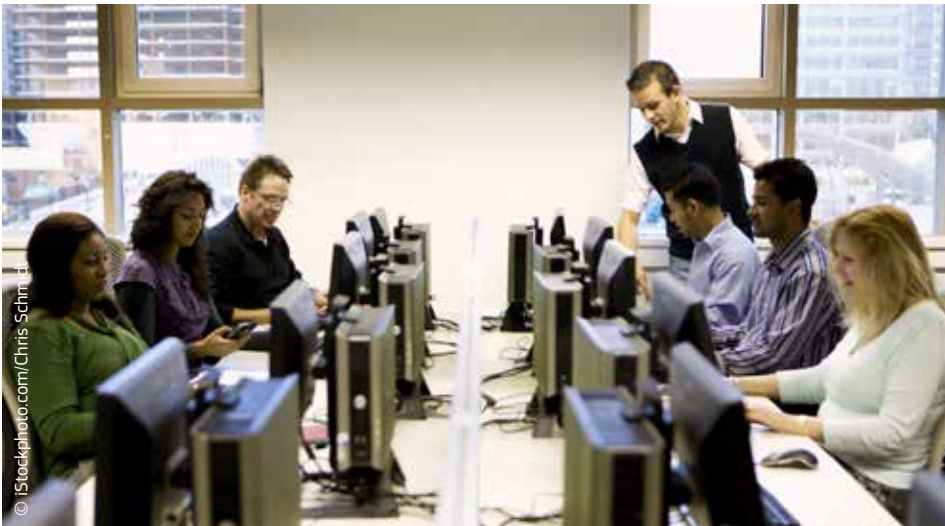
The European Globalisation Adjustment Fund helps workers made redundant in the EU find new jobs and receive training.

Since 1 January 2014, the role of the ESF as the main EU instrument for investment in people has been further reinforced. It is instrumental in helping EU countries respond to the EU's priorities and recommendations for national policy reforms in the fields of active labour market policies, social inclusion and employment policies, institutional capacity and public administration reform. 20 % of each country's ESF allocation has to be spent on social inclusion projects and the Fund must account for at least 23.1 % of the global cohesion policy funding at EU level, which will finally shape the total volume of ESF funding across the Member States.