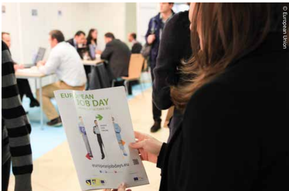
The EU has put forward proposals to tackle unemployment in Europe.

In particular, the EU is working to reduce the youth unemployment rate, which is more than twice as high as the rate for adults (23.6 % in comparison to 9.5 % in November 2013). It is promoting a more focused and holistic approach to the fight against youth unemployment: direct support to young people most in need, combined with structural reforms to enhance partnership, within all EU countries, between government departments, formal education systems, vocational education bodies, employment agencies, business, social partners and civil society organisations.