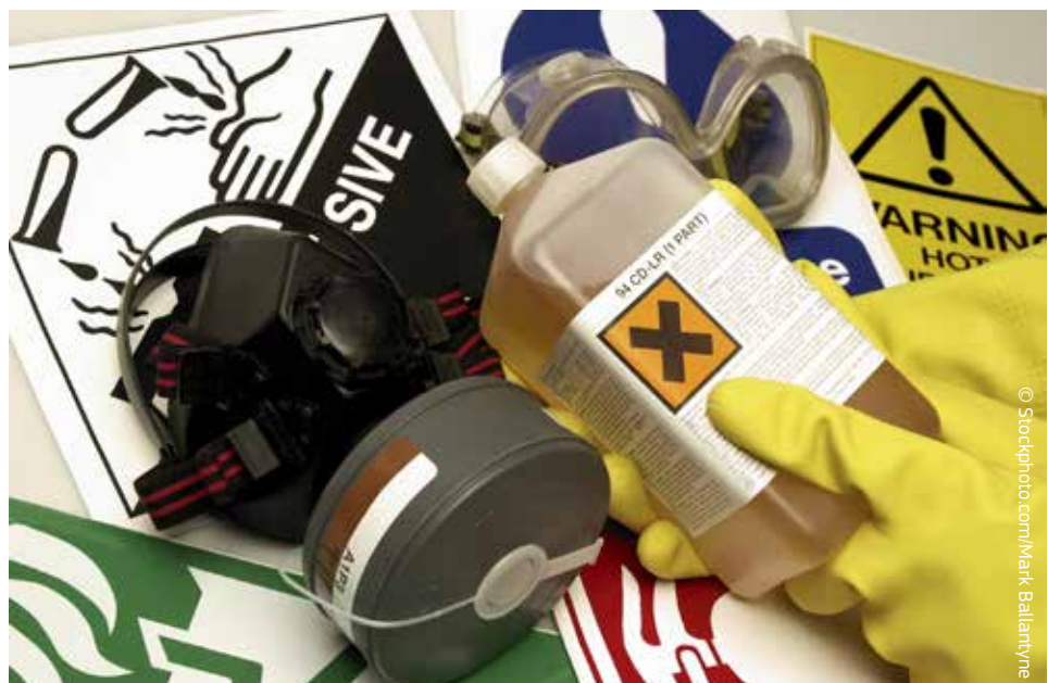
The EU has adopted robust health and safety laws.

The European Social Fund (ESF) — one of the EU's Structural Funds — was set up in 1957 to reduce differences in prosperity and living standards across EU Member States and regions. Accounting for around 10 % of the total EU budget, the ESF finances tens of thousands of projects across the Union. Funding is spread across the Member States and regions, in particular those where economic development is less advanced. From 2007 to 2013, close to 10 million people have benefited each year from measures funded by the ESF and some €76 billion has been paid out by the Fund to EU Member States and regions, supplementing approximately €36 billion of national public funding.