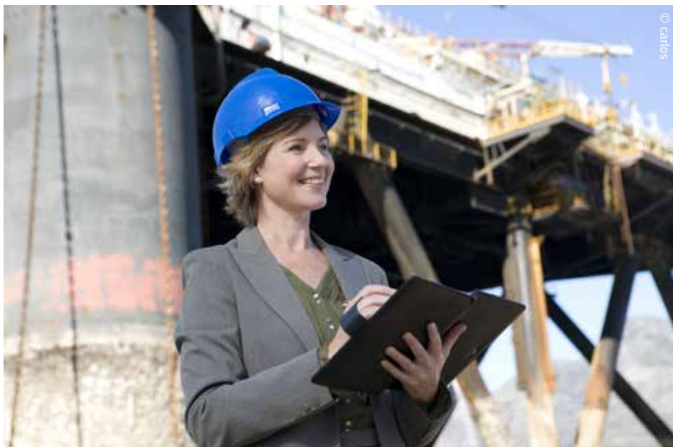
The EU has strong gender equality legislation.

As part of the programme for employment and social innovation (EaSI) , Progress accounts for 61 % of the EaSI budget (€550 million). It supports activities with a strong Europe-wide dimension such as comparable analysis, mutual learning and exchanges of practices in the field of employment and social policies. A specific budget of approximately €100 million is being devoted to test new solutions for employment and social policies in critical areas such as youth employment or inclusion. The most successful can be implemented on a larger scale with the support of the ESF.